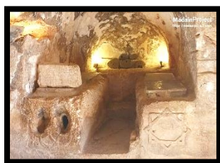
Cave of 7 Sleepers

Arrival Tel Aviv Airport welcome and assist then transfer to Jerusalem . we will have walking tour in old city of Jerusalem, we move to the Sakhara Mosque (Dome of the Rock) and Masjid Al-Aqsa for prayer where the Prophet Muhammad ﷺ made the Isra' and Mi'raj journey to the 7 th Heaven then visit all the Islamic domes and the buildings at Al-Aqsa and view the Wailing wall (Haet Al-Burq). You will have time to admire the amazing architecture and pray. We will go on to visit the Omar Mosque and, on the way, enjoy the sights and sounds of the oriental bazaar - admire the wares, taste the delicacies, and smell the spices. Visit Makam Alnabi Daoud then back to the hotel for diner and overnight.