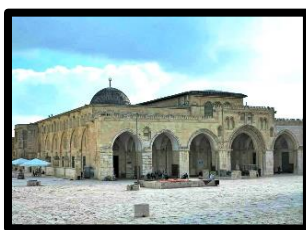
Masjid Al Aqsa