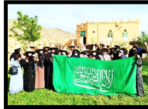
Al Amoudi Museum