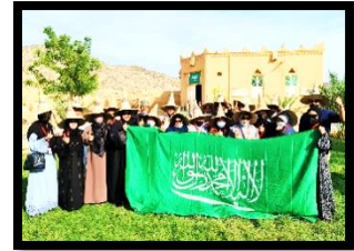
Al Amoudi Museum