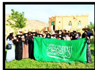
Al Amoudi Museum