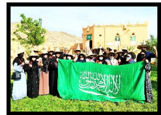
Al Amoudi Museum