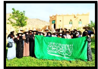
Al Amoudi Museum