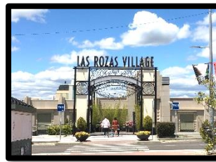
Las Rozas Village