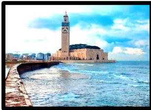
Hassan II Mosque

Afterwards, transfer to Marrakech . On the arrival, visit of the second oldest imperial city known as the Pearl of the South with the Saadian tombs, the Koutoubia , the Bahia Palace and the Menara gardens . Visit of the souks , the winding little streets and the Djemaâ El Fna place with its various and non-stop entertainment: storytellers, snake charmers, fire-eaters and more. Over-night in Marrakech.