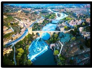
San Martin Bridge

After breakfast, we will enjoy a walking tour of the old medina of Fez with a local guide. The old medina is a beautiful labyrinth of intrinsic narrow streets. We will visit several mosques and madrasas, the famous Karaouine University , as well as the world famous leather tanneries. Overnight stay in Fez.