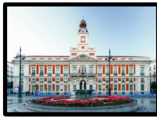
Puerta del sol