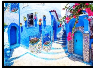
Chefcaouen (Blue Town)