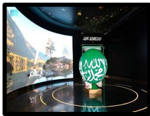
The Prophet's Exhibition

After immigration, meet our representative and you will be directed to purchase sim card. (Each individual must have a sim card & smartphone each). Check-in hotel. After Lunch, visit Tomb (Maqam) of Prophet Muhammad ﷺ and his companions like Abu Bakar and Umar , proceed to Baqi' cemetery (make salam to Rasullullah's family, companions, etc.), then perform sunnah prayers at Rawdah . (Subject to booking slot)