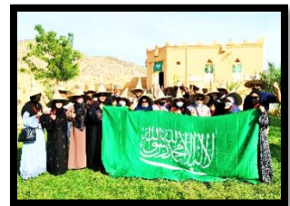
Al Amoudi Museum