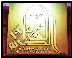
The Holy Qur'an Exhibition

Rasullullah's family, companions, etc.), then perform sunnah prayers at Rawdah . Iftar at masjid. After prayers return to hotel for dinner. Isya' prayer and Terawih.