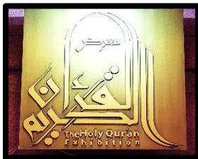
The Holy Qur'an Exhibition

Prophet Muhammad ﷺ and his companions like Abu Bakar and Umar , proceed to Baqi' cemetery (make salam to Rasullullah's family, companions, etc.), then perform sunnah prayers at Rawdah . Iftar at masjid. After prayers return to hotel for dinner. Isya' prayer and Terawih.