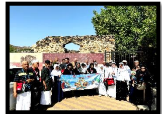
Historic Hudaibiyah Treaty